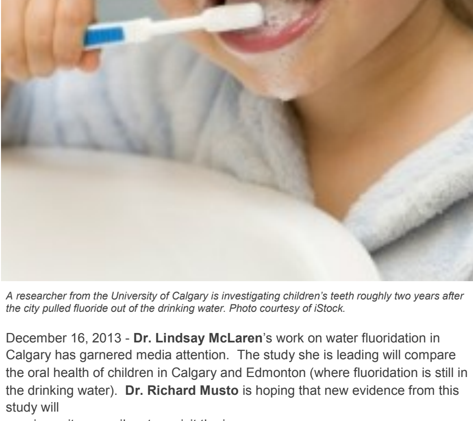
A researcher from the University of Calgary is investigating children's teeth roughly two years after the city pulled fluoride out of the drinking water.